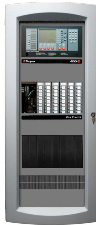
4100ES 3-Bay Cabinet, shown with optional: InfoAlarm Command Center, and Emergency Voice Equipment